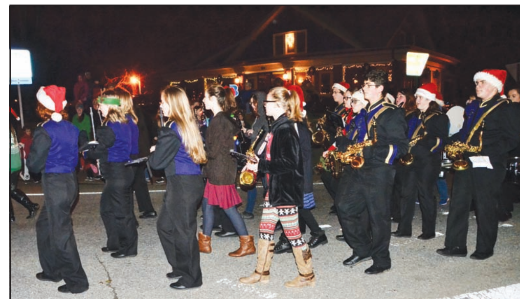
The Union County High School Marching Band participating in the nighttime 2018 Christmas Parade through Downtown Blairsville.

coincides with the monthly "Shop Late Thursdays," and downtown merchants will be staying open until 8 p.m. See Christmas, Page 3A